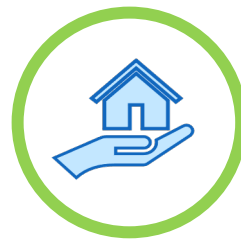
Permanent Supportive Housing