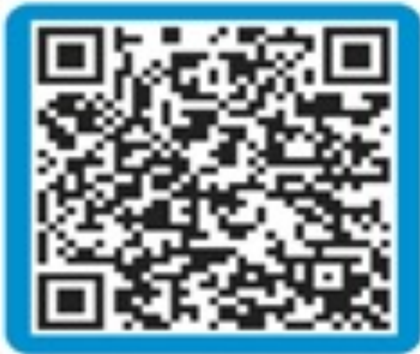
LA Care Health Plan, 2024