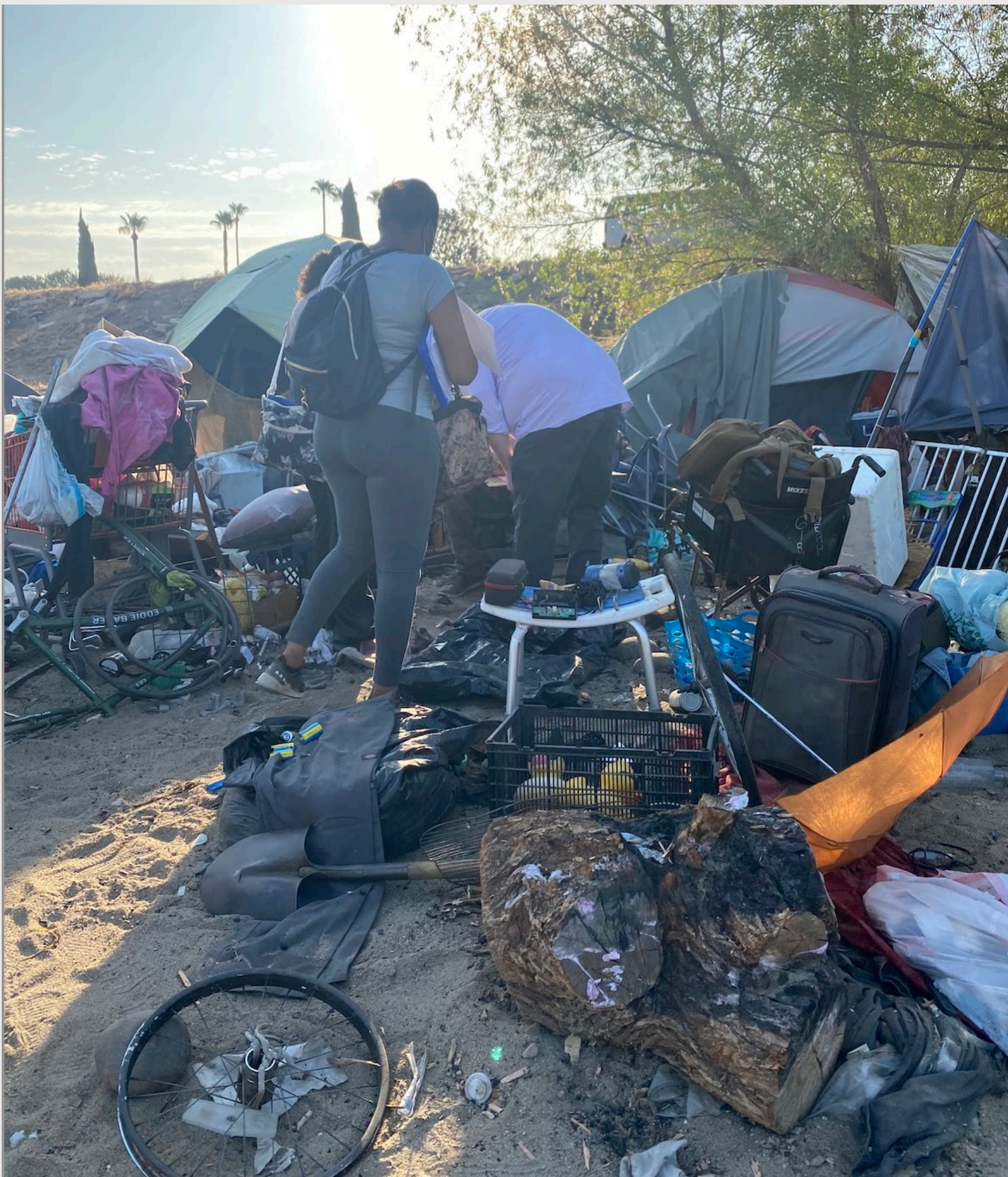
Clinical Sierra Vista, Bakersfield CA