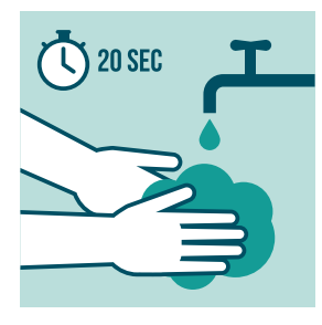
MAKE SURE HAND WASHING SUPPLIES ARE EASY FOR PEOPLE TO FIND AND USE.