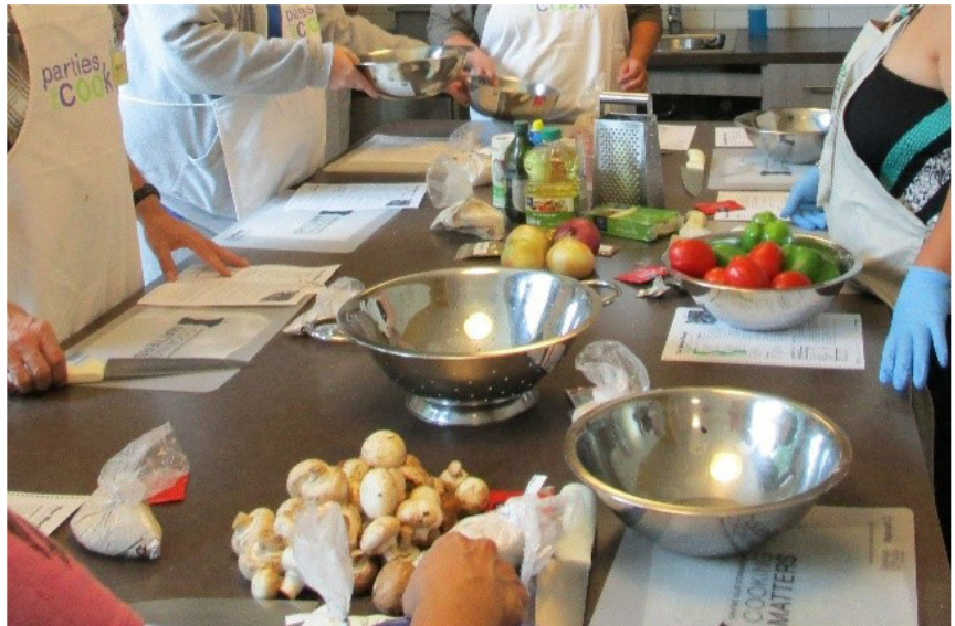
A “COOKING MATTERS” CLASS AT CENTRAL CITY CONCERN’S OLD TOWN CLINIC IN PORTLAND, OREGON

Our offerings include acupuncture, art therapy, positive thinking, healthy cooking, and a wellness calendar. Every day of the week there are several activities available that provide comprehensive spirituality, healing, qi gong, yoga, and clay and ceramics. We also have a new collaboration with Oregon Food Bank: Cooking Matters, a 6-week cooking program for clients who may not know how to cook or know what is in season; they get... a better understanding of nutrition and cooking on a budget... I would consider these programs preventive care. Most people just think of medical visits and checkups and things like that, but primary care is also about engaging people