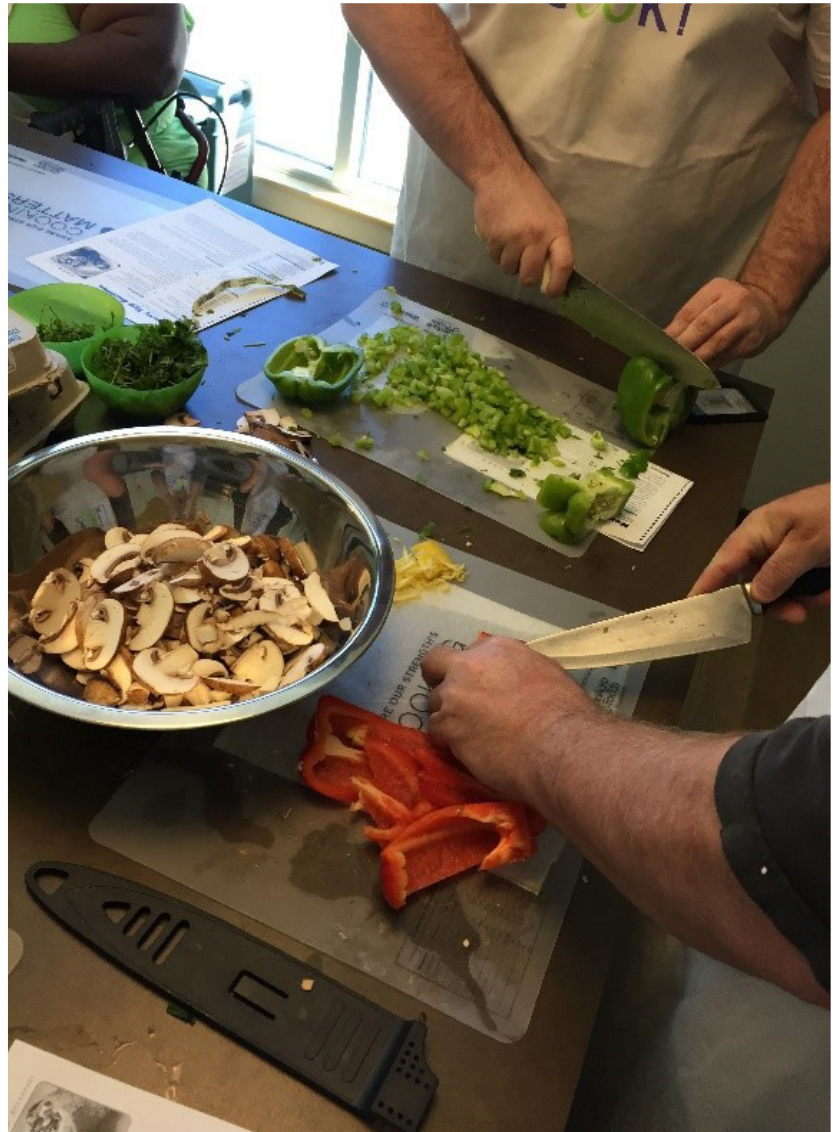
PARTICIPANTS IN A "COOKING MATTERS" CLASS PREPARE HEALTHY VEGETABLES

Service providers face a lot of pressure to meet reporting measures in order to maintain organizational stability and regular funding. In some cases, clinics may be measured and evaluated based on the implementation of indicators that are not actually the most relevant for the populations they serve and may not account for the complicated circumstances in which patients without homes live. Some care providers have come up with novel ways to meet requirements by combining screenings or developing creative ways to weave together interventions,