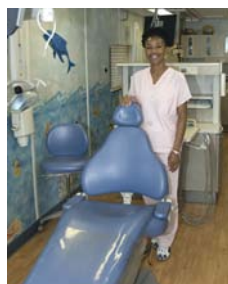
Cincinnati Mobile Dental Health Care Van