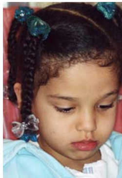
Young child with severe ECC

The second case also involves the rampant oral disease that can develop from early ECC but earlier intervention prevented lifethreatening health consequences.