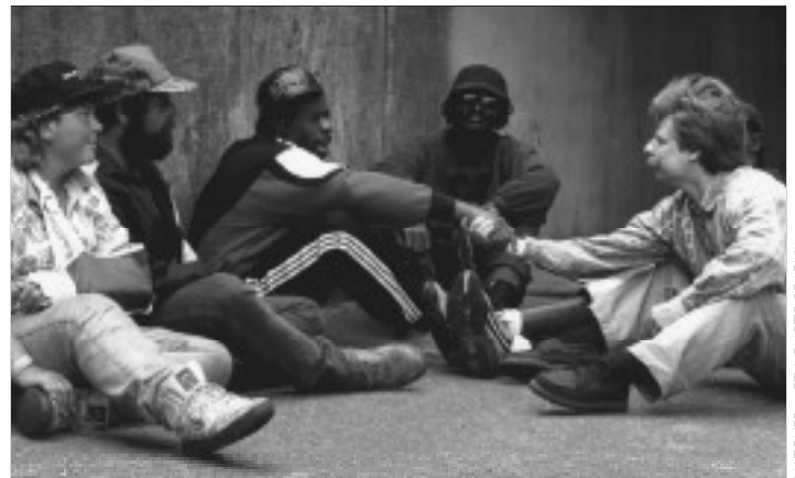
HATCHER & FELL PHOTOGRAPHY

women (46% versus 22% for women), and other drug problems at a rate half again as high (30% versus 20% for women). The overall incidence of mental health problems is similar in both groups (38% of men versus 43% of women). Of homeless clients reporting alcohol, drug or mental health problems, 73% are male.